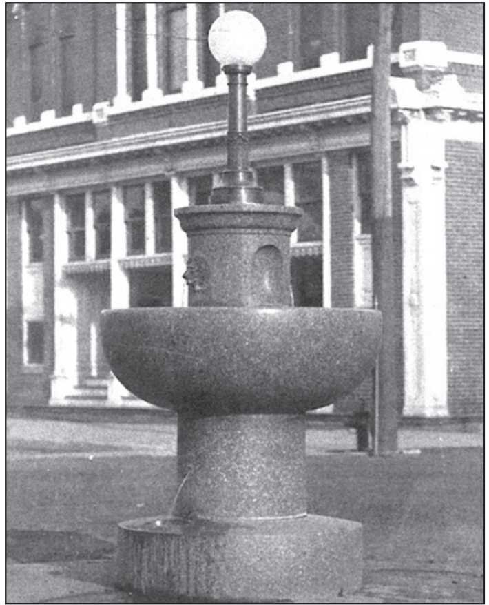
Seneca's horse fountain stood at the corner of 3rd and Main Street when it was first received as a gift from the National Humane Alliance in 1910. The fountain now stands in the City Park.

But, cars became more and more popular and horses on Main Street became less common. The controversy began and the big fountain in the middle of the street was thought to be a handicap to traffic. The fountain was removed from the intersection sometime before 1927. It would be several years before it was re-erected in the park. "The present editor missed this era of controversy," further states the 1960 article. "When I arrived on